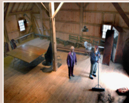
above: The goal is to finish the Barn before the Auction!

Send Barn donation, write check to NSHPC ..... (visit: www.nicholasstoltzfus.org )